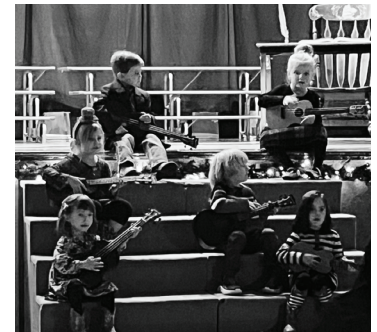
Above: Preschool students play the ukulele for the program.