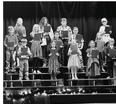
Above: Kindergarten through Fifth grade sing songs during the play.

To the left: Elves have successfully updated Santa's wardrobe. From rapper to country they had tried all styles but settled on traditional with a green hat.